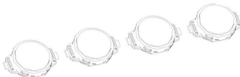
Side and isometric views of the four dome types (dimensions in mm).